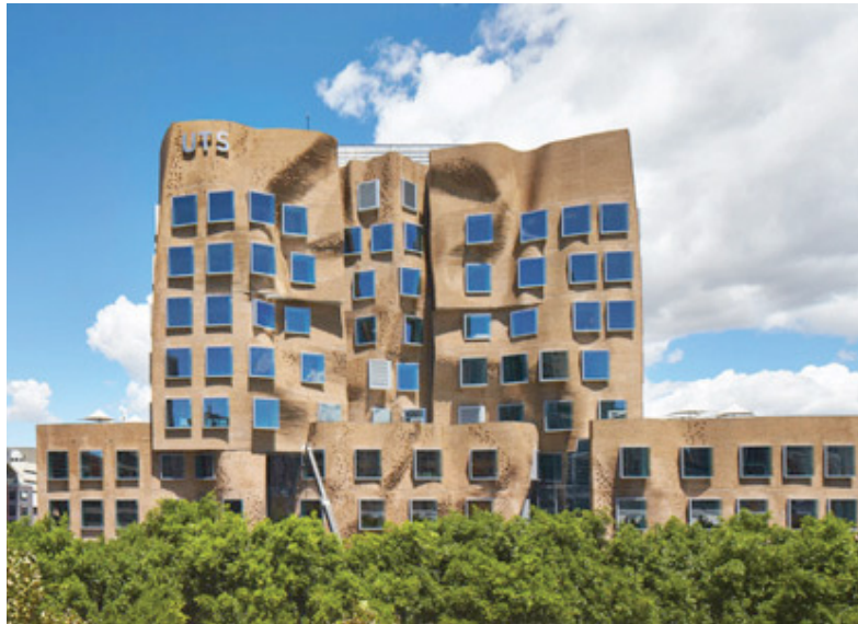
Dr Chau Chak Wing Building designed by Frank Gehry UTS, Sydney