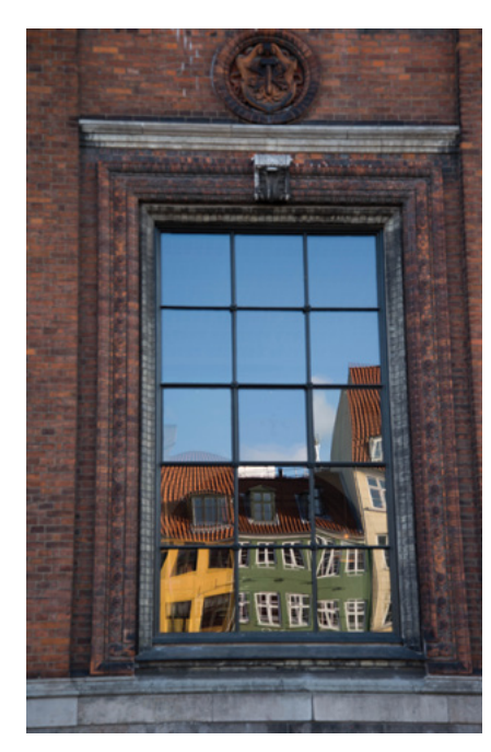
Houses in Nyhavn, Copenhagen