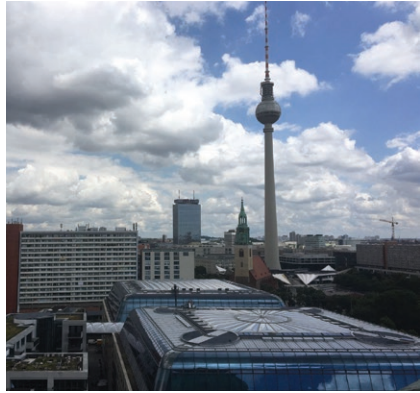
View from the Dom, Berlin