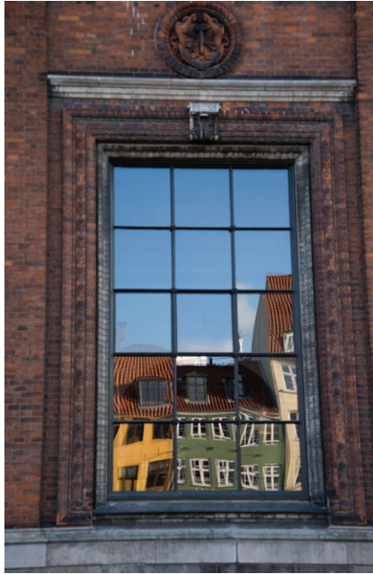
Houses in Nyhavn, Copenhagen