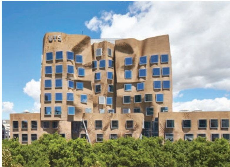
Dr Chau Chak Wing Building designed by Frank Gehry UTS, Sydney